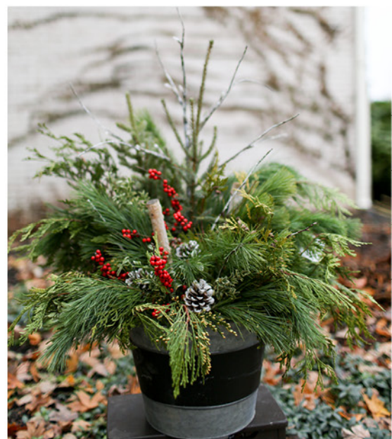
Make your own winter porch pot at Altum's.