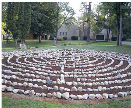
Labyrinth at Camp Chesterfield