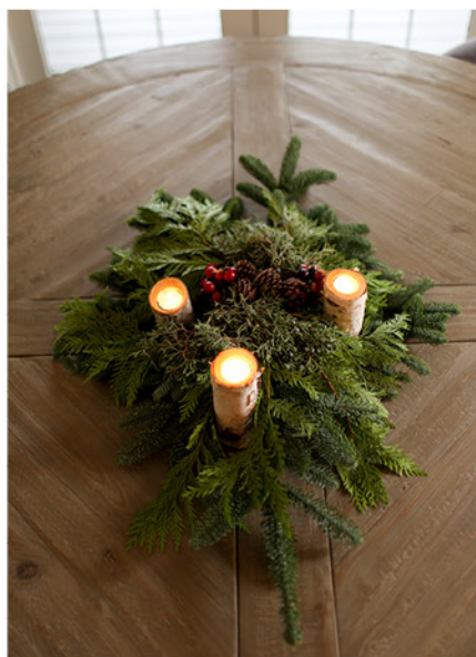
Bring the outdoors inside with live, seasonal greenery.