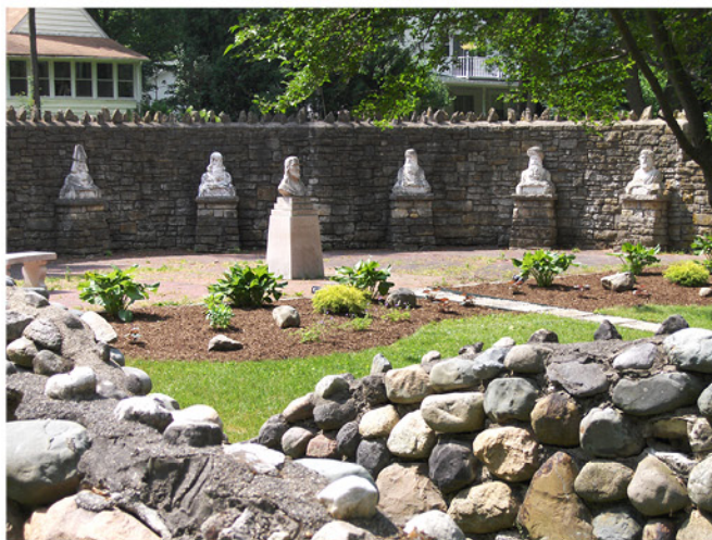
Camp Chesterfield: The Trail of Religions contains busts of Con- fucius, Mohammad, Zeus, Osiris, Abraham, Buddha, Jesus, Zoro- aster, Lao-Tse, and Vardhamana.